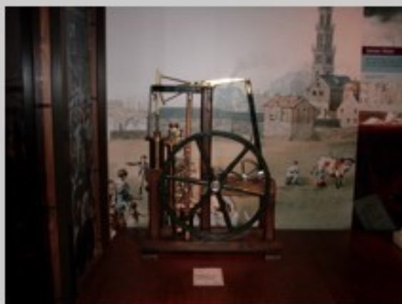
James Watt's personal steam engine in Glasgow