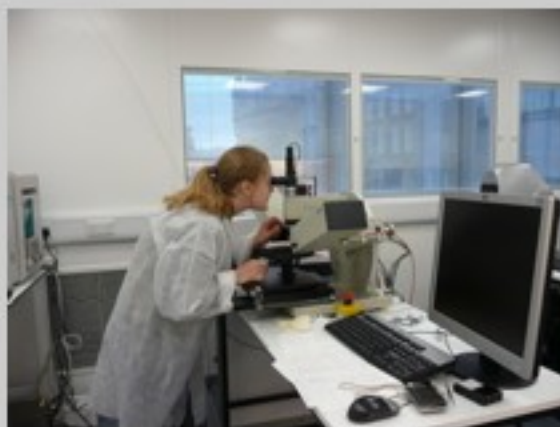
Working with the ellipsometer - time off from sightseeing