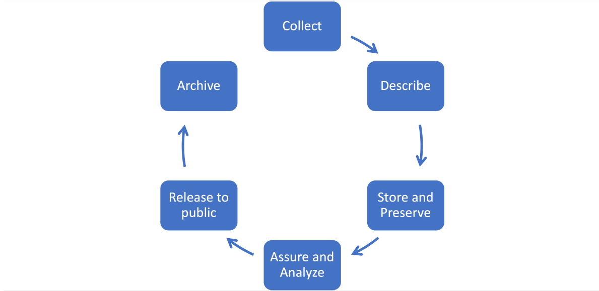
Figure 1: The LIGO Data Life Cycle