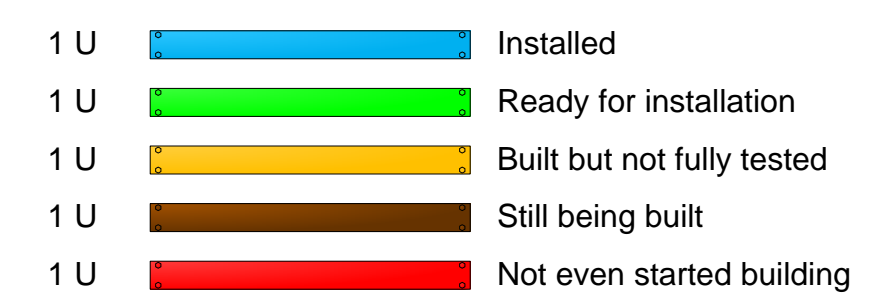
Status as of 15 September 2011