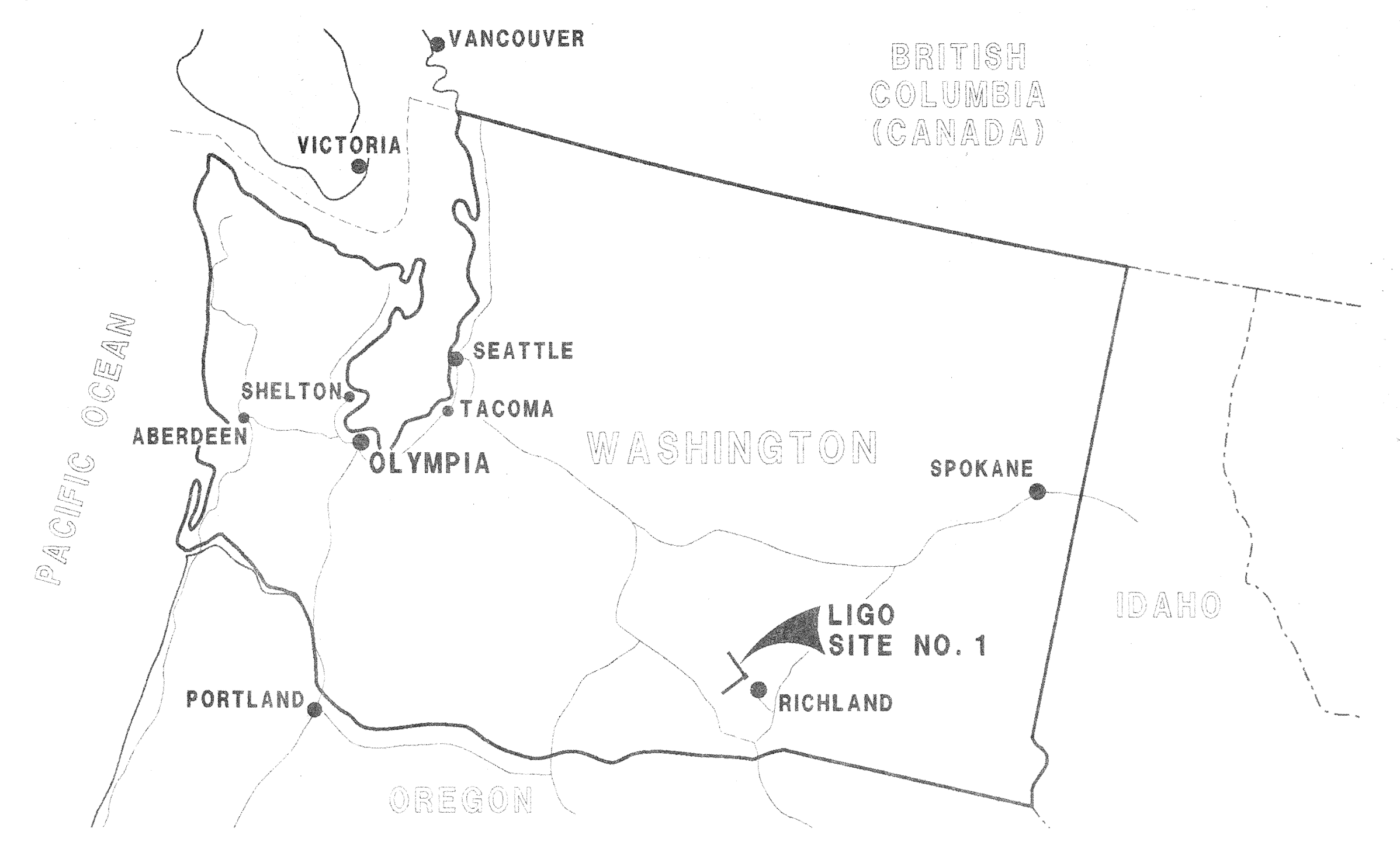
SITE NO. 1 HANFORD, WASHINGTON