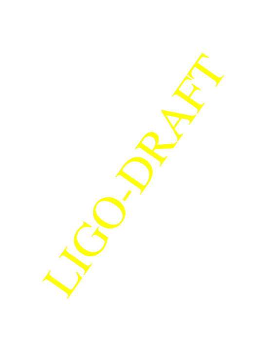
Figure A-3: To be supplied