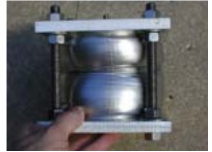
P Test Brazed Bellows 4.jpg