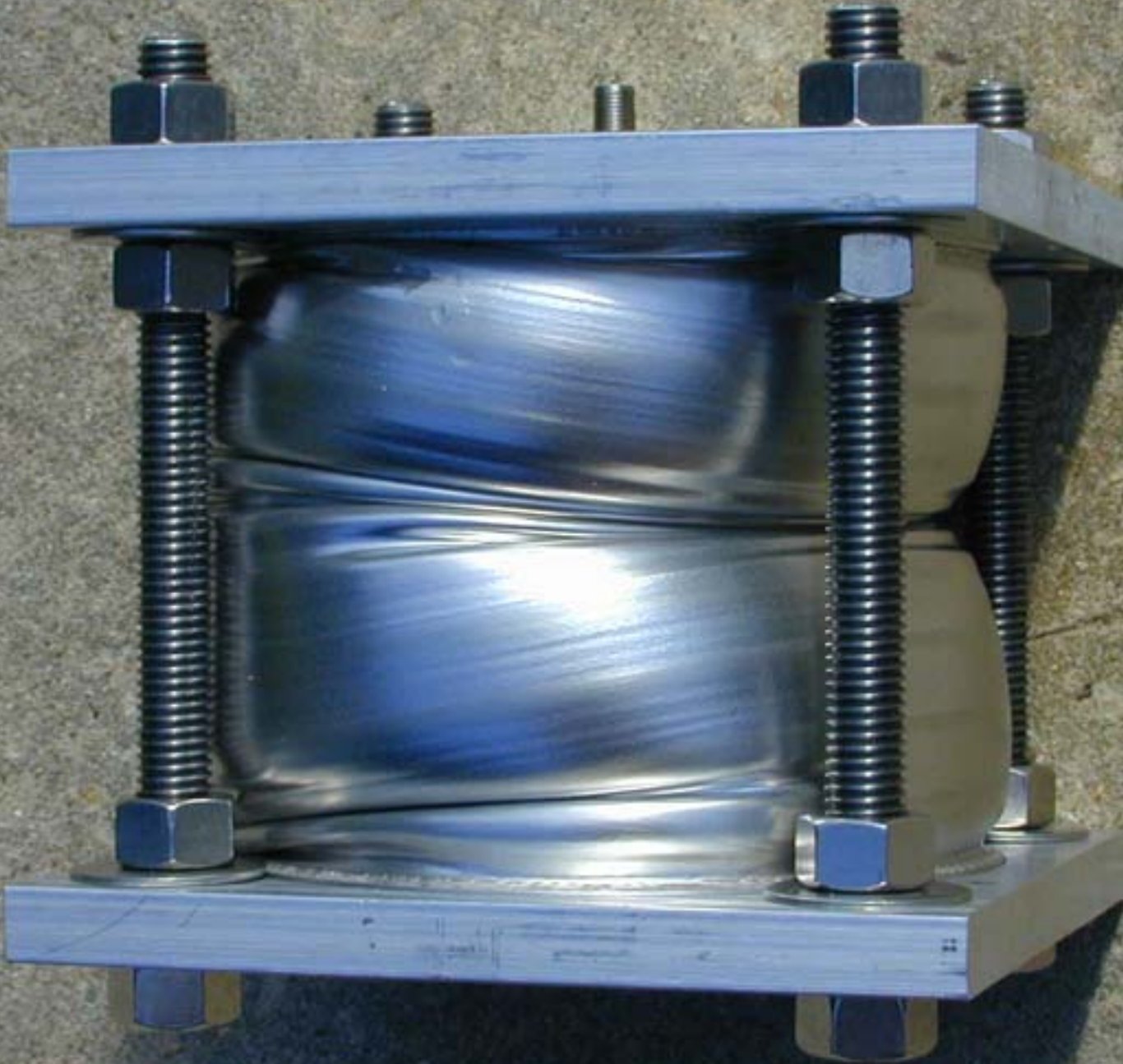
P Test Braze Bellows 4.jpg