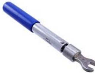
Figure 4, SMA Torque Wrench, DigiKey Part Number A99929-ND

Preset SMA torque wrenches are available from many vendors, and typically cost around $400. An excellent tool has been created by MiniCircuits Inc. that allows easy access to high density SMA connectors. The MiniCircuits tool has flat surfaces between the knurled finger grips that permit use of a torque wrench. These should be standard fare for LIGO maintenance. Shown below are images of a typical SMA torque wrench, and ordering details for the MiniCircuits extension tool.