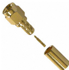
Figure 1, SMA Connector

For any given RF coaxial connector in use at LIGO, there are specific manufacturer’s instructions detailing proper attachment. Rather than duplicate these instructions, it is good engineering practice to read, understand, and follow these instructions. A conversation with one of the site electrical engineering staff will certainly aid in finding such instructions and gaining proficiency. A representative summary for an Amphenol SMA connector is given below.