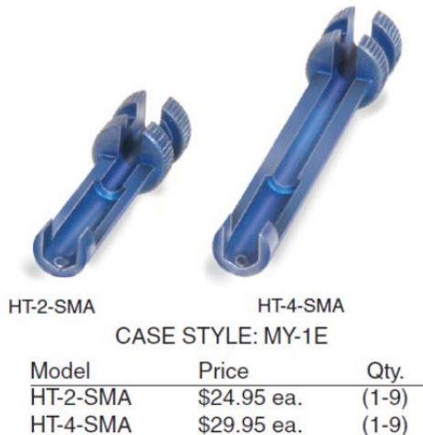
Figure 5, MiniCircuits HT-Series SMA Wrench