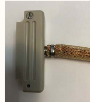
Accu-Glass Part Number 100421